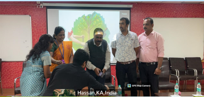
Two day workshop on Advanced Embedded System Design 26th to 27th July 2024